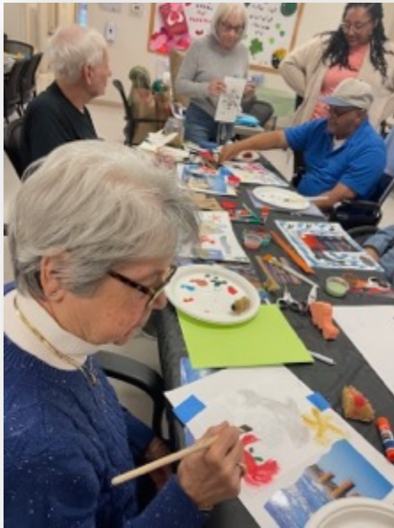
Collage Workshop at Harbor Lights Senior Center