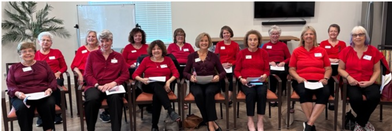
Environment Committee: Trails Day At Cape Henlopen State Park