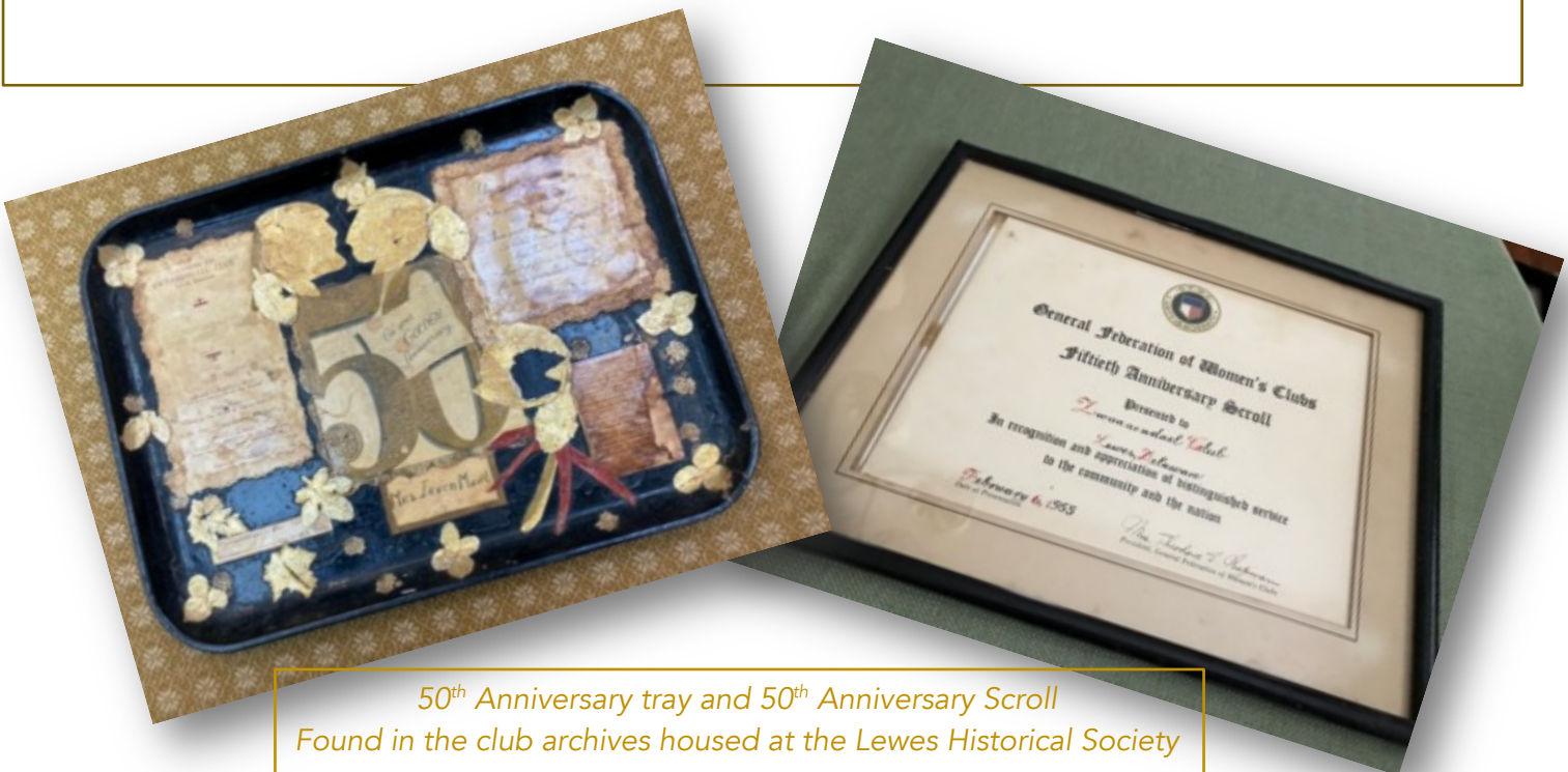
50 th Anniversary tray and 50 th Anniversary Scroll Found in the club archives housed at the Lewes Historical Society