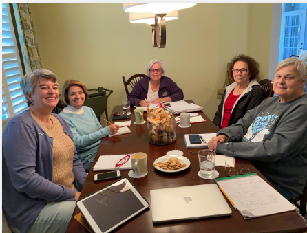
November Environment Committee Meeting Note: No paper or plastic utensils use.